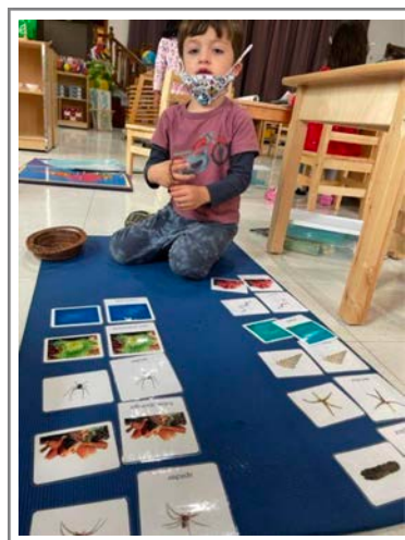
Classification Cards: Vocabulary